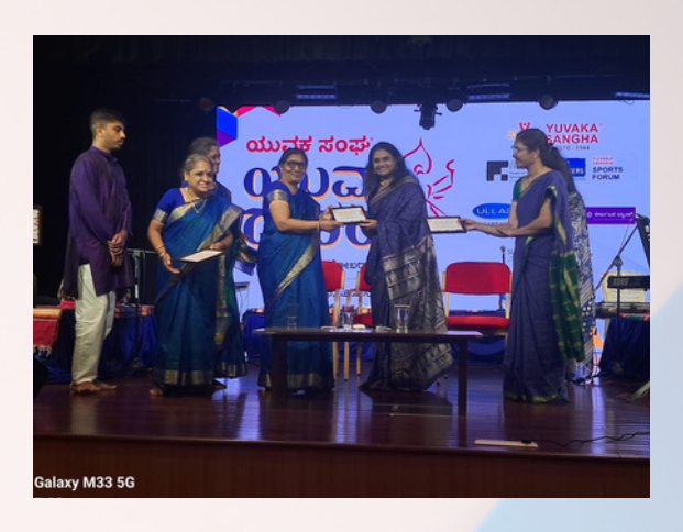
Award by Yuva Dasara Team - Karunada Sadaki