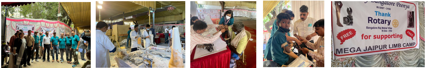
Limb Making Area

On the occasion of the Mega Limb Fitment Camp, visited Ganesh Bagh, Sri SBS Jain Sangh Trust, #9, Bhagvan Mahaveer Road (Infantry road), Shivajinagar. Our Club was a partner club to Rotary Bangalore Peenya for this Mega Limb Fitment Camp where artificial limb/ fore-arm to amputees calipers for polio affected are fixed.