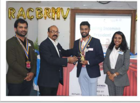
Installation of Rotaract Club Raj Mahal Vilas Sept.10 , 2023