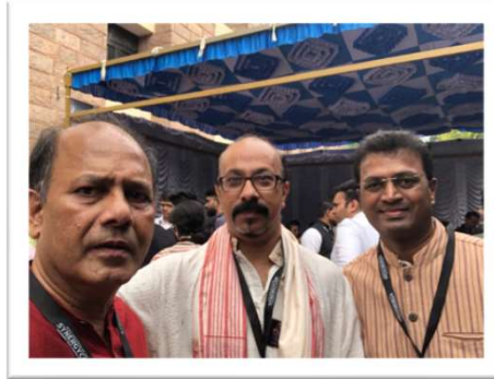
ICGF-Youth Service-Synergycon Sept.17 , 2023