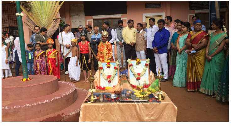
Our 73rd Independence Day was celebrated among the students and staff of BBMP Gopalram school, where sweets were distributed to the students.

This also gave the opportunity to release our 'Save Water and Food' sticker for public awareness.