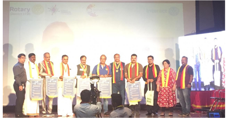
Interact Milana : A congregation held in Nelamangala, where the club sponsored the making of 4-way test scrolls.