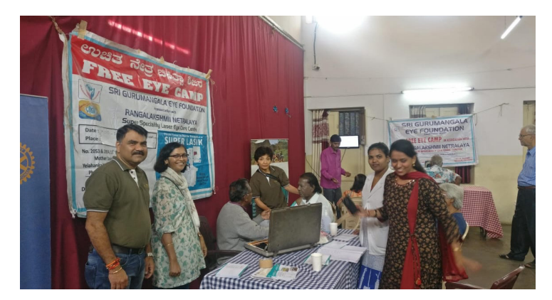
On the occasion of World Sight Day, RI District 3190's project of Rotary Vision 2020 with the help of the Avoidable Blindness Committees, conducted eye screening camps at various schools and an old age home.

Rotarians and Rotaractors of Dist.3190 came together for Pinkathon- A Walkathon for Sustainable Menstruation and Menstrual Health for Women . This helped support the Womens Microentrerprise - Gramalakshmi- that makes reusable cloth pads.