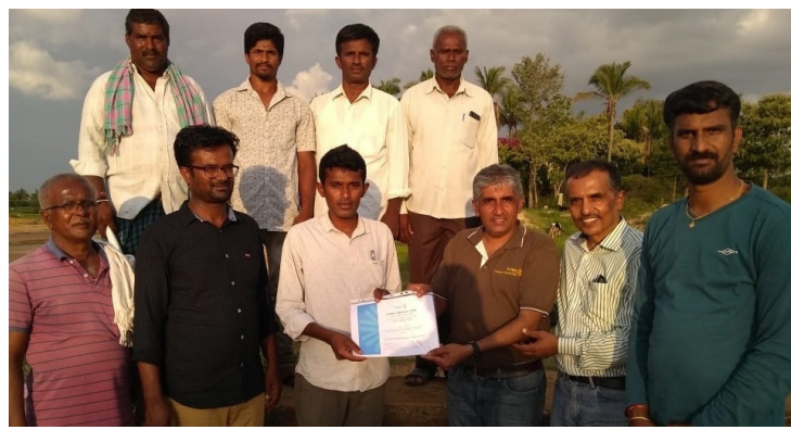
Our club received the charter certificate for the 1st ever Rotary Community Corps (RCC) established in our club history in the name RCC- RMV Arkavathy . The RCC comprises of 15 local residents of Koira Village.